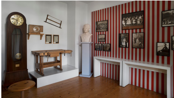
Elser's biography and works - police interrogation report – press reports.