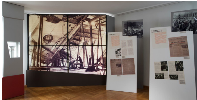
Georg Elser and his assassination plan, 8 November 1939. Hitler's Beer Hall Putsch in 1923 - decision to attempt the assassination - preparations - the assassination attempt of 8 November 1939 – aftermath of the explosion - Nazi propaganda – reactions.